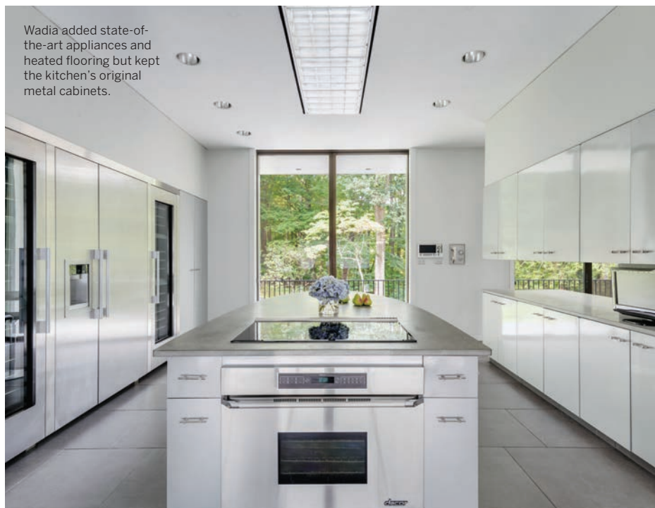
Wadia added state-of-the-art appliances and heated flooring but kept the kitchen's original metal cabinets.